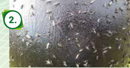
A black suspended horse fly trap-ball with Sticky Trap glue