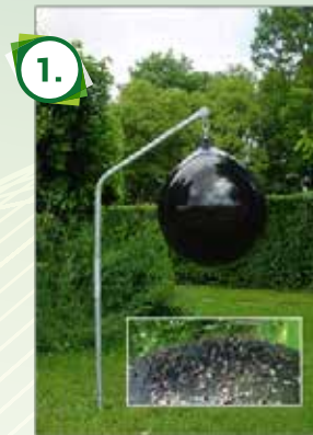
The Loer glue trap